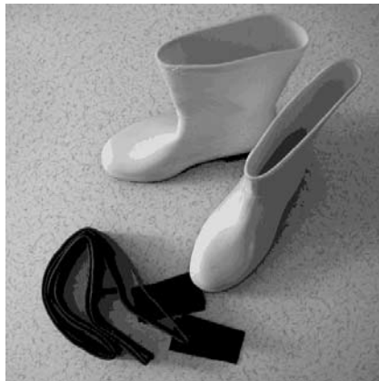
1. get some rainboots, bicycle tube and pieces of velcro.