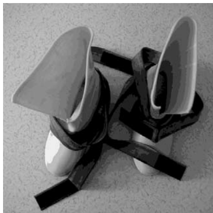
7. simple remake - boots like new.