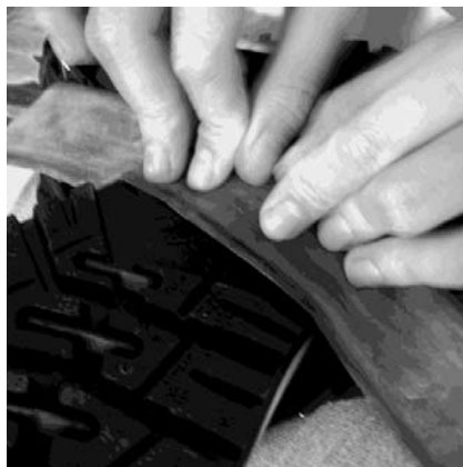
4. fold the tube piece and glue the middle under the sole with epoxy.