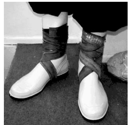
8. wrap up tightly around the ankles - resist!!