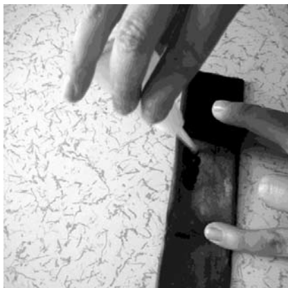
6. and also on the other end of the velcro.