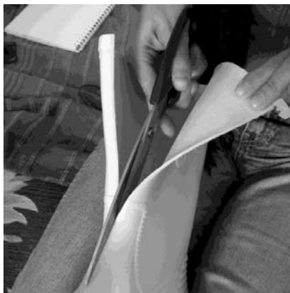
3. open the rainboots in the front to the ankle.